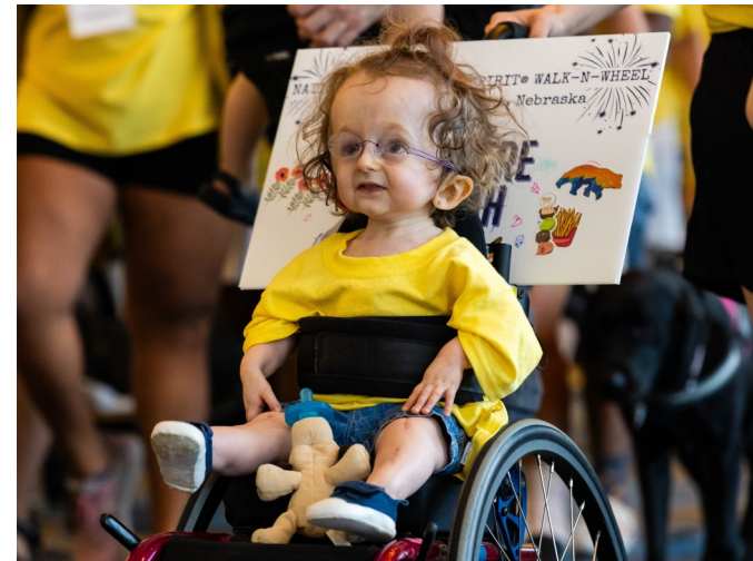
A young attendee showing their unbreakable spirit®