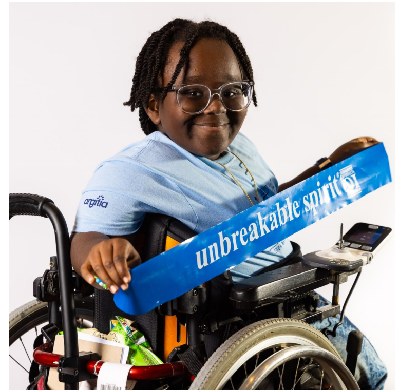
Attendee of the 2024 OIF National Conference wearing their Conference T-Shirts