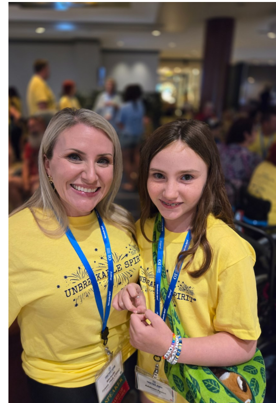
2024 National Conference attendees wearing the OIF National Walk-n-Wheel t-shirt