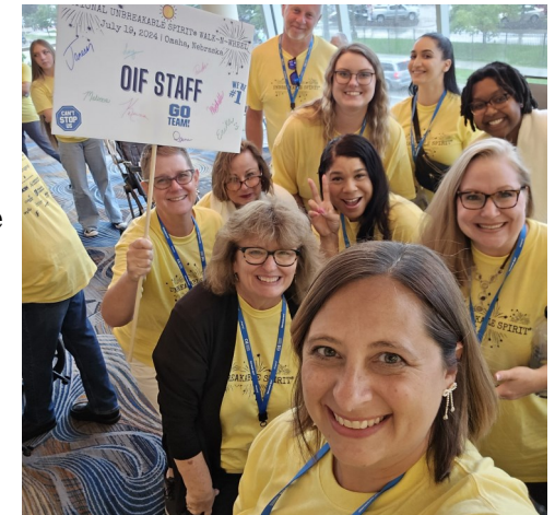
Team OIF Staff at the 2025 National Unbreakable Spirit® Walk-n-Wheel