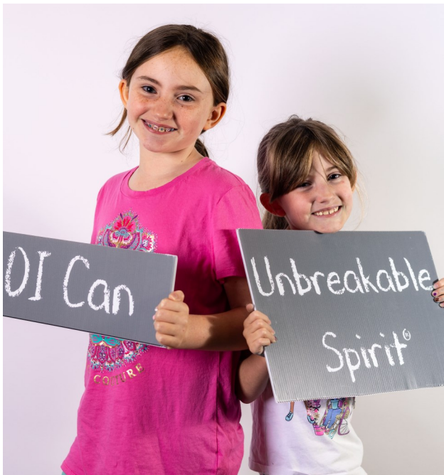
Young attendees at the 2024 National Conference in Omaha, NE.