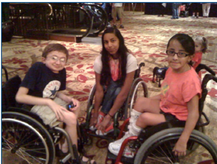
Young attendees socialize between conference activities