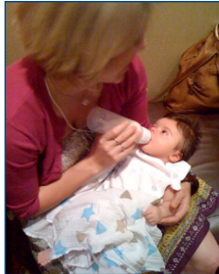
A newborn and her mother attending their first National Conference