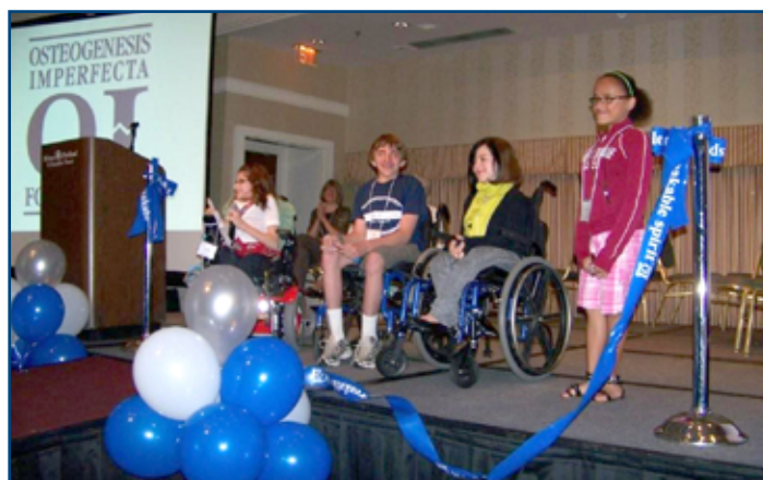
Young adults officially declaring the start of the 2010 Conference!

The Crystal Gateway Marriott is located 1-mile from Ronald Regan Washington National Airport (DCA). The hotel offers a complimentary accessible shuttle. Metro, Washington, DC's subway system, travels from the airport to the hotel and costs $1.50 for the one-way trip. Taxi fare between DCA and the hotel is approximately $7. Blue Top Cab offers wheelchair-accessible taxi service and reservations can be made by calling 703-243-8294.