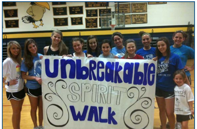
MH/MH Cheerleaders at the Atchison, KS, Unbreakable Spirit Walk