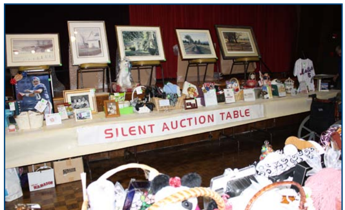
Beefsteak silent auction table

Over the years, we have made several adjustments, including a silent auction and we now give away hundreds—rather than just a handful—of beautiful prizes. At our largest event, 415 people helped us to raise more than $21,000, and our grand total of the 19 events is well over a quarter million dollars for OI! With our 20 th anniversary coming up on October 22 nd , our “Bone China Beefsteak” will be a celebration of our many supporters and their outstanding loyalty and generosity.