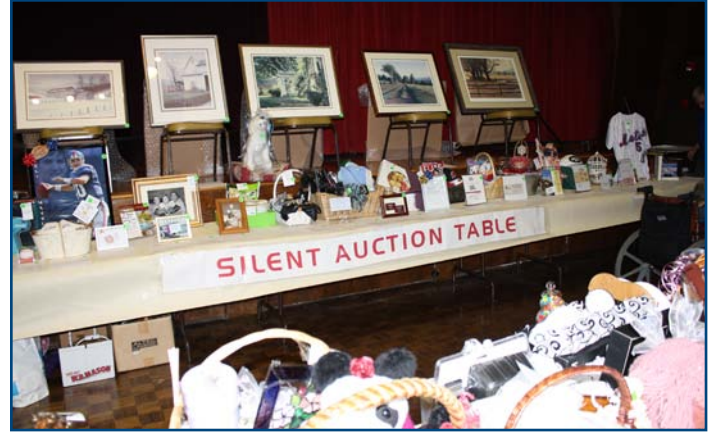
Beefsteak silent auction table

Over the years, we have made several adjustments, including a silent auction and we now give away hundreds—rather than just a handful—of beautiful prizes. At our largest event, 415 people helped us to raise more than $21,000, and our grand total of the 19 events is well over a quarter million dollars for OI! With our 20<sup>th</sup> anniversary coming up on October 22<sup>nd</sup>, our "Bone China Beefsteak" will be a celebration of our many supporters and their outstanding loyalty and generosity.