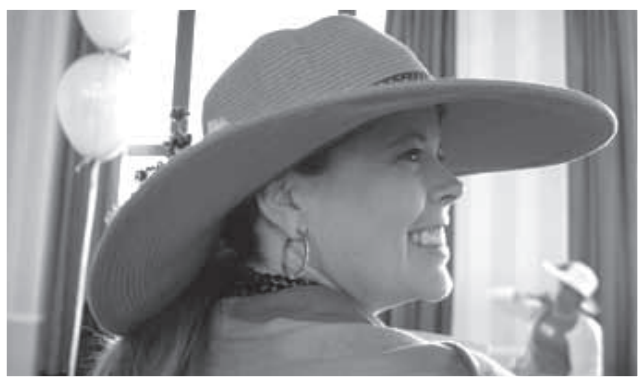
Celebrating the Kentucky Derby themed 2012 FWSBI