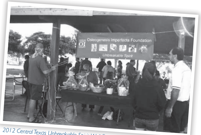
2012 Central Texas Unbreakable Spirit Walk®