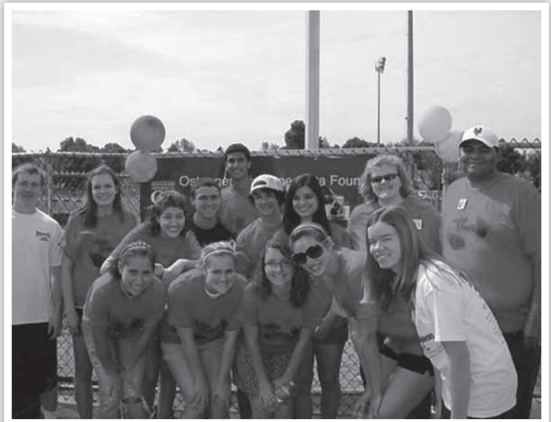
2012 Alle Shea Unbreakable Spirit Walk®

It is not too late to schedule your own event for OI Awareness Week 2013! Email events@oif.org or call 301-947-0083 for more information. You can also check out www.oif.org/awarenessweek to find more details about how you can become part of OI Awareness Week 2013 and spread the Unbreakable Spirit ®.